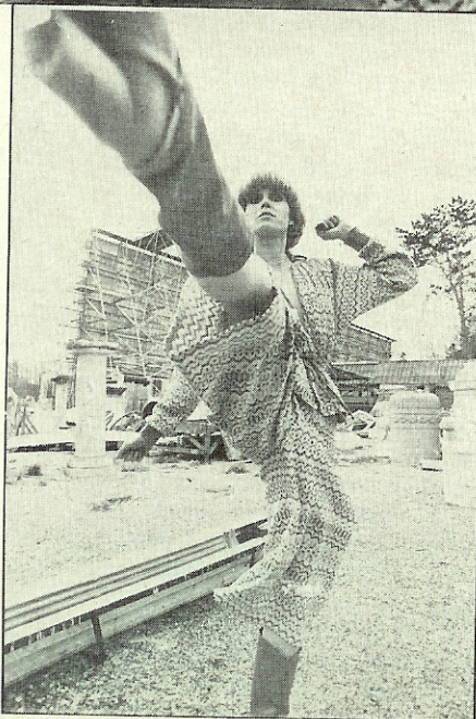
Avenging angel with a ravaging right. Joanna Lumley puts in the boot and fist, straight at our columnist's 21mm Nikkor. Above, taking a break from her "Avenger" exertions (85mm Nikkor)